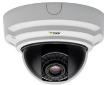
Axis P3343/44 Internal