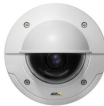
P3343/44 VE Outdoor