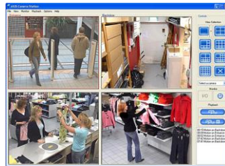
Axis Camera Station