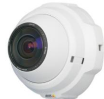
Axis 212 PTZ (No Moving Parts)